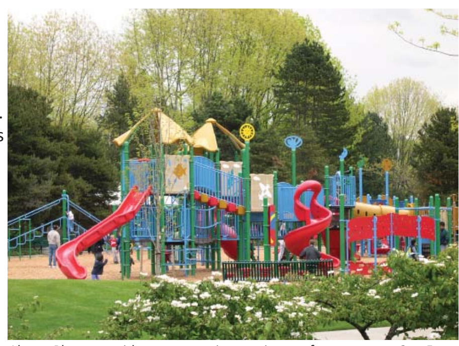
Above: Play area with age appropriate equipment for age groups 2 to 5 years and 5 to 12 years.

Visit rentonwa.gov or call 425-430-6600 for more information on this facility and other Renton parks.