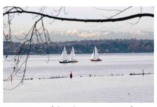
Scenic views of the Olympic Moutains from the park's shoreline.