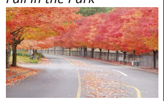
Enjoy fall's outstanding colors at the entrance to the park.