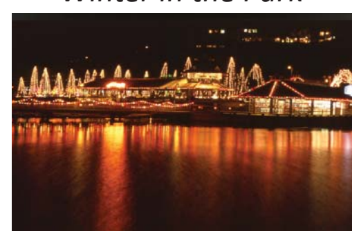
Ivar's Clam Lights as seen from Lake Washington.