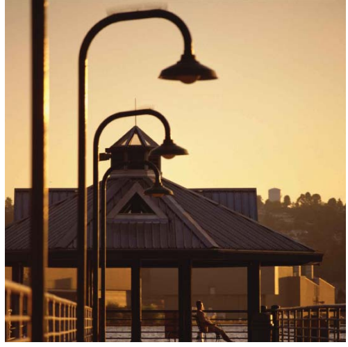
Enjoy the sunset at the Pilot House on the Waterwalk.